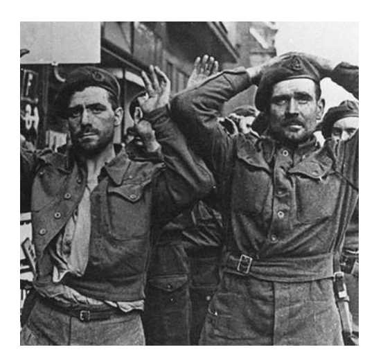
British POWs at Arnhem Bridge.

To the unknowing, it was just another board game. To the knowing, it was a key that took them from being a Prisoner of War to freedom and going home.